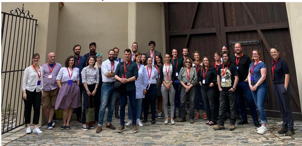
ECR MERC 2022, Prague

The aim of the conference is to create and stimulate an international forum for postgraduate and early-career researchers in Medieval Archaeology. We offer opportunities for networking to foster further inter-regional collaboration, and aim to promote top-quality research in an accessible and informal atmosphere.