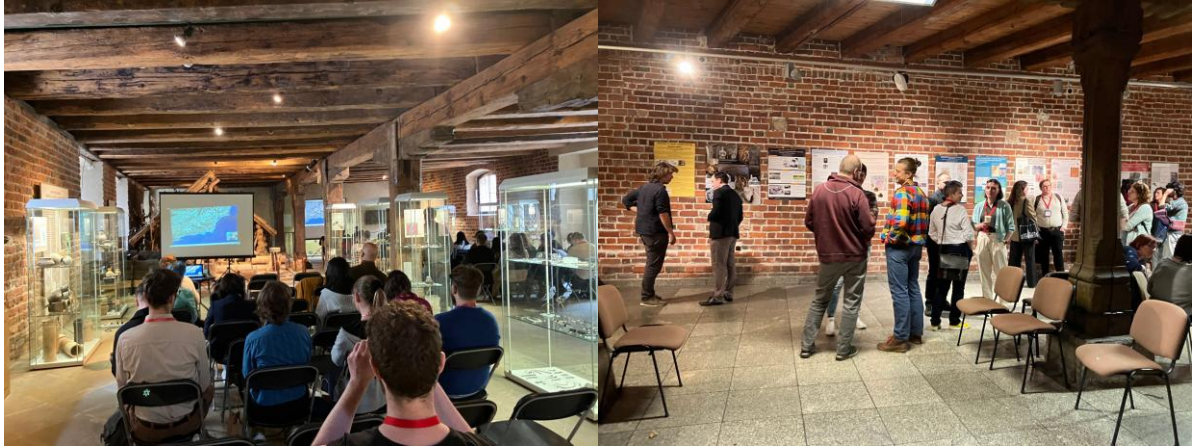
ECR MERC 2024, Wrocław

The presented papers and posters are offered for publication in a peer-reviewed open-access conference Proceedings . Besides being available in e-versions, those proceedings are also issued and available in physical copies at Yellow Point Publications .